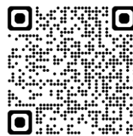
Company of Makers