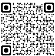
Anchoring Minds (RN & RM families)