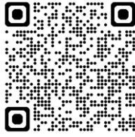
SSAFA Support & Advice