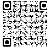
Blind Veterans UK Sight Loss Support