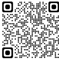
Little Troopers Military Children Support