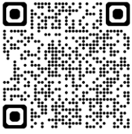
Royal British Legion Support & Advice